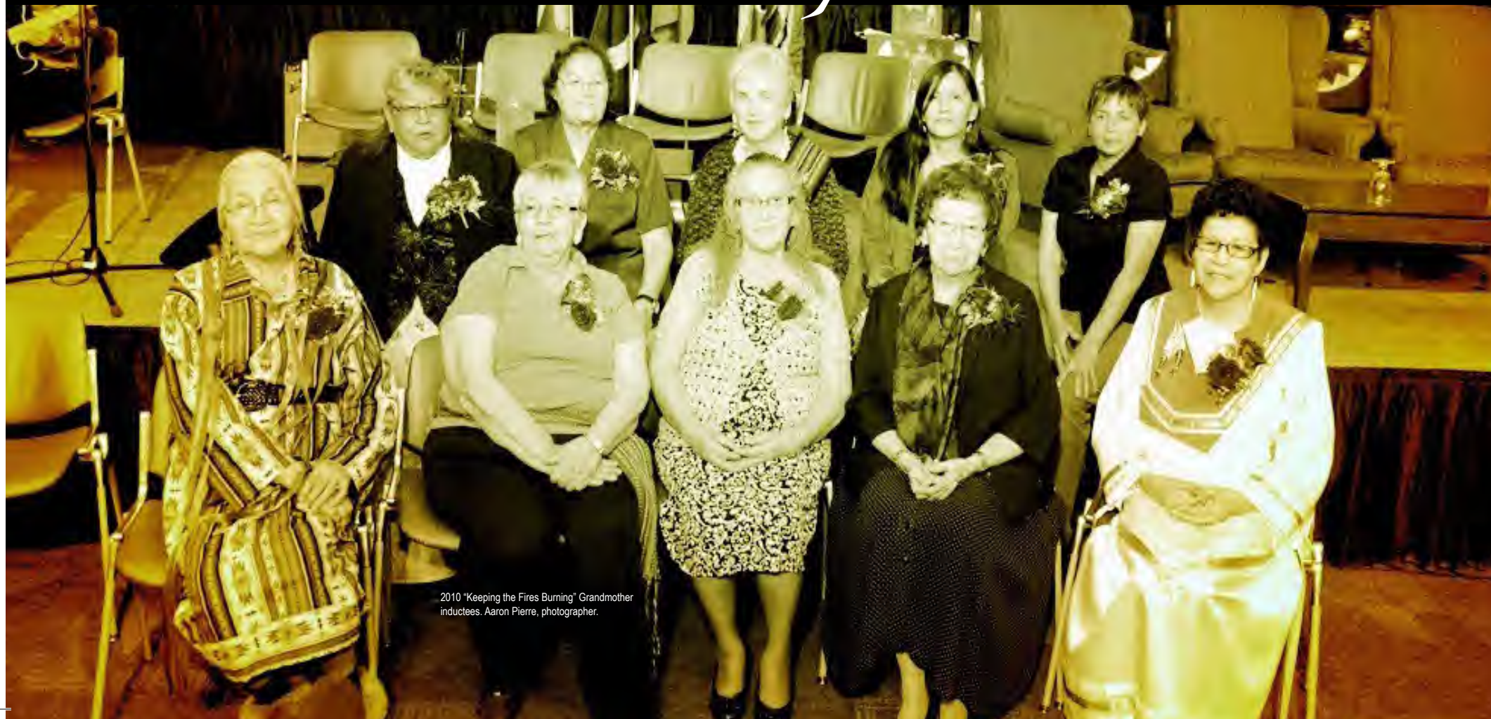
2010 "Keeping the Fires Burning" Grandmother inductees.